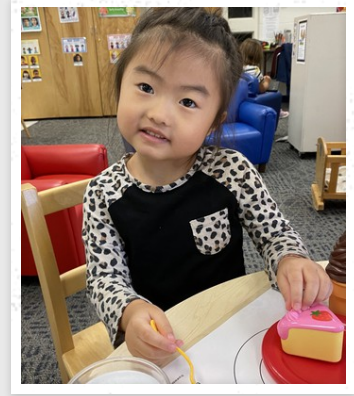
PHOTO GALLERY Wakanda 4K